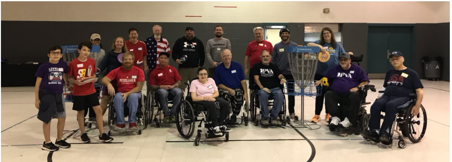
Above: Full group photo of participants, instructors and volunteers that helped throughout the day. Below: PVA and Wounded Warrior veterans practicing their throwing skills.