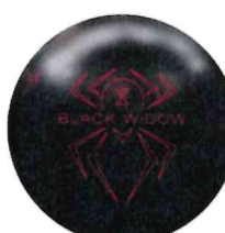
Hammer - Black Widow 2.0 Hybrid